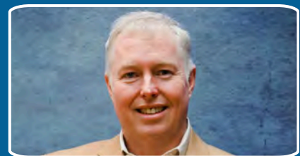
Mayor Derek Pleadwell